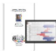
Approved observations feed into reports and portfolios