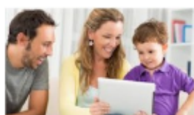
Parents email observations to the school